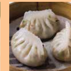
潮州小粉果 Chiu Chow Dumplings Mined Pork, Shrimp & Peanut Dumplings (L)