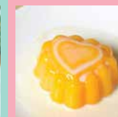
香芒凍布丁 Mango Pudding House Made Fresh Mango Pudding (M)