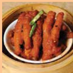
豉汁蒸鳳爪 Chicken Feet Steamed with Black Bean Sauce (L)