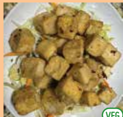
椒鹽豆腐 Peppercorn Tofu Crispy fried tofu cubes, tossed with salt & pepper $14.95