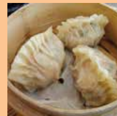
鮮蝦香茜餃 Hung Sai Gow Shrimp & Cilantro Dumplings (L)