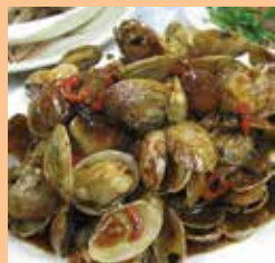
豉椒炒蜆 Clams Blk Bean Sauce Clams stir-fried in a savory black bean sauce $14.95