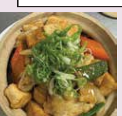
鹹魚雞片豆腐煲 Salty Fish Chicken Pot Diced salty fish with chicken, tofu & veg. in a hot pot $18.95