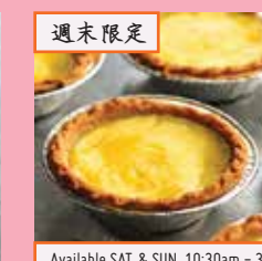
週末限定 迷你蛋撻仔 Egg Tarts Baked Lightly Sweet Pastry (M)