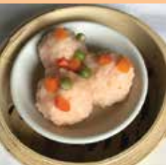
百花蒸蝦丸 Steamed Shrimp Balls Grounded Shrimp & Rolled into Balls (L)