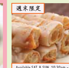
週末限定 特式炸兩 Zha Liang Steamed Rice Roll with Fried Donut (L)