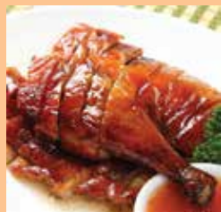
明爐烤鴨 Roasted Duck Crispy-skinned, tender & juicy duck roasted to perfection, served with a plum sauce $14.95