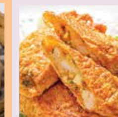
鮮蝦腐皮卷 Fried Bean Curd Rolls Shrimp Wrapped Bean Curd Roll (L)