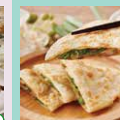
VEG 家鄉蔥油餅 Scallion Pancake Pan Fried Pancakes (S)