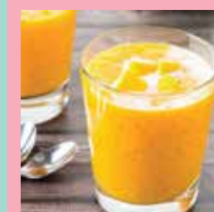
楊枝甘露 Mango Pomelo Sago House Made Fresh Mango, Grapefruit & Tapioca (L)