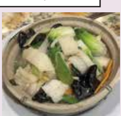
竹筴粉絲上素煲 Vegan Vermicelli Pot With clean mushroom, bok choy, & veg. in a hot pot $16.95