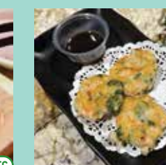
煎墨魚蝦餅 Shrimp Cake Pan Fried Grounded Shrimp Cake with Diced Calamari (L)