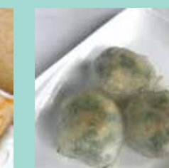
韭菜煎蝦餅 Gin Har Bang Pan Fried Shrimp & Chive Dumplings (L)