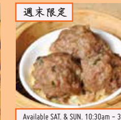
週末限定 山竹牛肉球 Beef Meat Balls Grounded Beef Rolled into Balls (M)