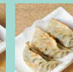
香煎素鍋貼 Veg Potsticker Pan Fried Veggie Dumplings (S)