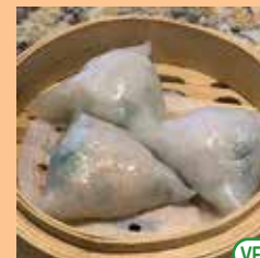
VEG 山竹豆苗餃 Pea Tip Dumplings Vegetarian Favorites, with Bean Curd & Pea Tip Leaves (L)