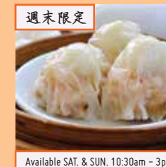
週末限定 鵪鶉蛋燒賣 Quail Eggs Siu Mai Siu Mai Topped with Quail Eggs (XL)