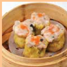
泰潮燒賣皇 Siu Mai Pork & Shrimp Dumplings (L)