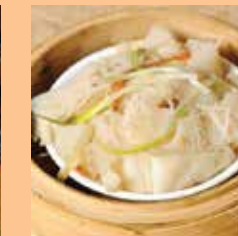
薑蔥牛百葉 Beef Omasum Steamed with Ginger & Scallion (XL)