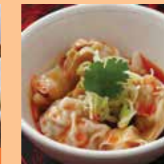
紅油抄手 Spicy Wonton Shrimp and Pork Wontons in a Chef Spicy Sauce (L)