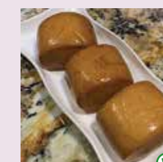
VEG 迷你炸饅頭 Mini Fried Buns Deep Fried Mini Buns (S)