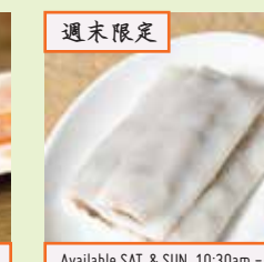
週末限定 牛肉腸粉 Beef Chang Fun Steamed Beef Rice Roll (L)