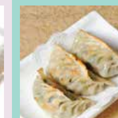
京都鍋貼餃 Potsticker Pan Fried Pork Dumplings (S)