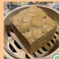
VEG 古法馬拉糕 Sponge Cake Brown Sugar, Milk, Egg and Flour (S)