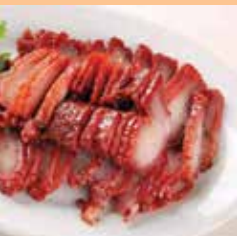
蜜汁叉燒 Roasted Pork Pork belly roasted to perfection with a sweet & savory blend of soy sauce, sugar & spices $14.95