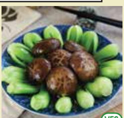
冬菇扒菜膽 Bok Choy with Mushroom Stir-fried bok choy, topped with Shiitake mushroom $19.95