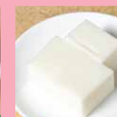
香滑椰汁糕 Coconut Pudding House Made Coconut Pudding (S)