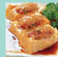
煎釀豆腐 Stuffed Tofu Pan Fried Tofu Stuffed with Chopped Shrimp (L)