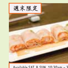
週末限定 春風得意腸 Special Chang Fun Steamed Rice Roll, wrapped w/Beancurd Sheet and Shrimp (2M)