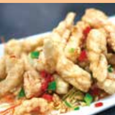
椒鹽鮮魷 Peppercorn Calamari Crispy calamari, served with a sweet and sour sauce $14.95