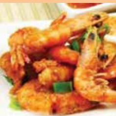
椒鹽有頭蝦 Peppercorn Shrimp Crispy whole shrimp with heads, tossed with salt & pepper $14.95