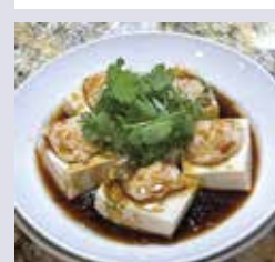
蒸釀豆腐 Steamed Stuff Tofu Steamed stuff tofu, with grounded shrimp $14.95