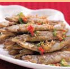
椒鹽多春魚 Peppercorn Smelt Crispy fried smelt fish, tossed with salt & pepper $14.95