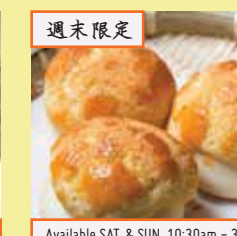
週末限定 波蘿奶皇包 Ball Law Bao Baked Custard Bun (M)