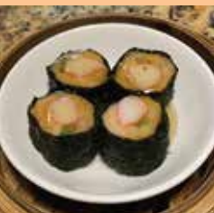
日式紫菜卷 Seaweed Shrimp Roll Celery & Shrimp rolled with Seaweed (L)