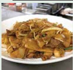
乾炒牛河 Beef Chow Fun Beef stir-fried with flat rice noodles, onions, scallions & ginger $15.95