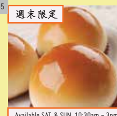
週末限定 焗叉燒餐包 Baked Pork Bun BBQ Pork Baked Bun (M)