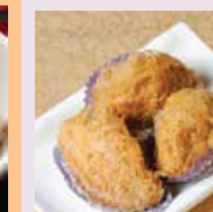
蜂巢荔芋角 Taro Puff Stuffed with Minced Pork & Taro (M)