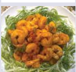
辣子蝦 Chili Shrimp Stir-fried shrimp, in a savory chili sauce $19.95