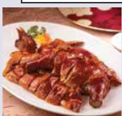
當紅炸子雞 Fried Chicken HK Style (Whole) $49.95 (Half) $25.95