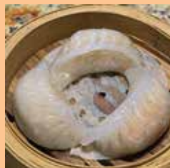
XO金菇餃 XO Enoki Dumplings Shrimp, Celery, Carrots & Enoki Mushroom (L)