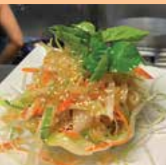
涼伴海蜆 Jelly Fish A refreshing mix of tender jelly fish, carrots & scallions, tossed in a zest vinegar dressing $14.95