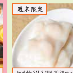
週末限定 鮮蝦腸粉 Shrimp Chang Fun Steamed Shrimp Rice Roll (XL)