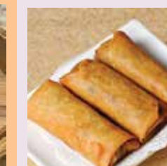
脆皮蝦春卷 Ty Spring Rolls Stuffed with Pork and Shrimp (L)