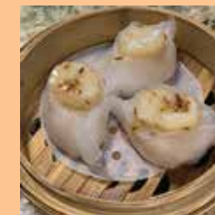
XO帶子餃 Scallop Dumplings Sea Scallops, Shrimp and XO sauce (SP)