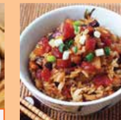
臘味糯米飯 Sticky Rice Bowl Pork, Sausage, Mushroom, Peanuts, Dried Shrimp (XL)