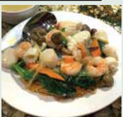
泰潮海鮮煎麵 Seafood Pan Fried Noodles Sea scallops, jumbo shrimp, calamari, carrots, mushroom & veg. $24.95