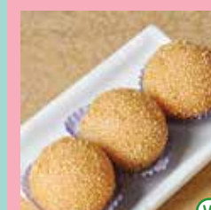
VEG 豆沙芝麻球 Sesame Ball Fried Rice Flour Ball with Red Bean Paste (S)