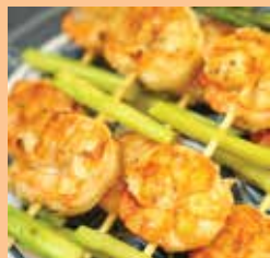
串燒大蝦 BBQ Shrimp 6 pieces jumbo bbq shrimp on skewer $14.95