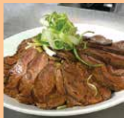
五香牛腩 Five Spice Beef Shank Tender beef shank slow braised in a rich five spice broth $14.95