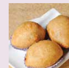
五香鹹水角 Ham Sui Gok Deep Fried Sticky Rice and Pork Dumplings (S)