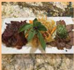
泰潮拼盤 (叉燒+牛腩+海蜆) Appetizer Combo Platter Beef Shank, Roasted Pork, Jelly Fish $24.95