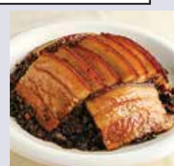
梅菜扣肉 Braised Pork Belly with Mustard Greens $17.95