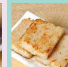
臘味蘿蔔糕 Turnip Cake Pan Fried Turnip Cake (M)