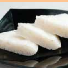
白糖糕 Steamed Rice Cake Fluffy, Lightly Sweet Rice Cake (S)