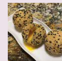
黃金流沙球 Fried Custard Balls Fried Rice Flour Balls with Custard Fillings (L)