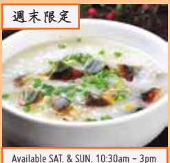
週末限定 皮蛋瘦肉粥 Preserved Eggs & Pork Congee $9.95 油條 Fried Donut $3.95 Available SAT. & SUN. 10:30am - 3pm