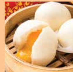
黃金流沙包 Custard Bun Lightly Sweet, Creamy Custard Bun (M)