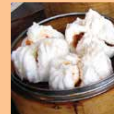
蜜汁叉燒包 Cha Siu Bao BBQ Pork Steamed Buns (L)