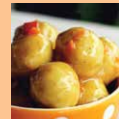
咖喱魚蛋 Curry Fish Balls Steamed in Curry Sauce (L)