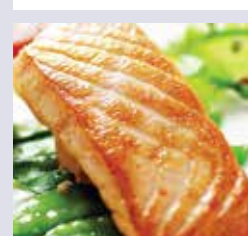
照燒煎三文魚 Teriyaki Salmon Pan seared Atlantic salmon with veg. $22.95