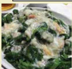
蟹肉扒豆苗 Crabmeat Pea Tip Leaves Stir-fried pea tip leaves, topped with real crabmeat $22.95