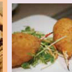
百花釀蟹鉗 Stuffed Crab Claws Crab Claws Stuffed with Grounded Shrimp (SP)