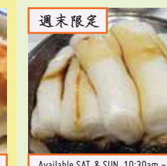
週末限定 白腸粉 Plain Chang Fun Steamed Plain Rice Roll (M)