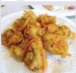
椒鹽生蠔 Peppercorn Oyster Lightly battered oysters, tossed with salt & pepper $29.95