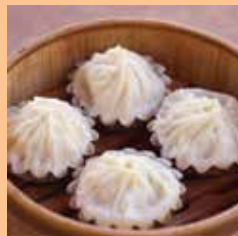
上海小籠包 Xiao Long Bao Mini Steamed Soup Pork Buns (M)