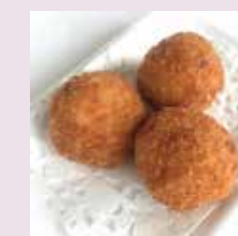
黃金炸蝦球 Fried Shrimp Balls Grounded Shrimp & Rolled into Balls (L)