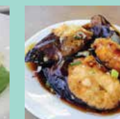
煎釀茄子 Stuffed Eggplant Pan Fried Eggplant Stuff with Grounded Shrimp (L)