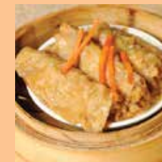
蠔皇鮮竹卷 Steamed Bean Curd Rolls Pork, Shrimp Stuffed Bean Curd Rolls (M)