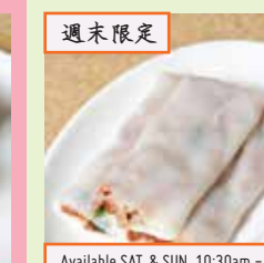
週末限定 叉燒腸粉 Pork Chang Fun Steamed Rice Roll with BBQ Pork (L)