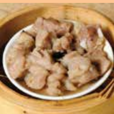
豉汁蒸排骨 Pork Spare Ribs Steamed with Black Bean Sauce (L)