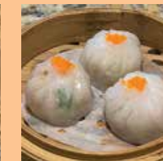
魚子蟹肉餃 Crabmeat Dumplings Dumplings Stuffed with Real Crabmeat (2L)