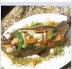
骨香龍利球 Stir-fried Flounder Fish Stir-fried whole flounder fish with mix veg. $45.95