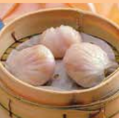
晶瑩鮮蝦餃 Har Gow Shrimp Dumplings (L)

小點(S) $4.95 中點(M) $5.95 大點(L) $6.95 加大點(XL) $7.95 特點(SP) $15.95