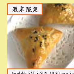
週末限定 金牌叉燒酥 Cha Siu So BBQ Pork Pastry (M)