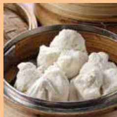
薑蔥雞包仔 Gai Bao Chicken, Shrimp, Mushroom Steamed Buns (L)