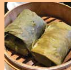
荷葉珍珠雞 Sticky Rice Lotus Leaf Pork, Sausage, Egg, Sticky Rice Wrapped in Lotus Leaf (XL)