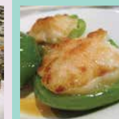
煎釀青椒 Stuffed Pepper Pan Fried Pepper Stuff with Grounded Shrimp (L)